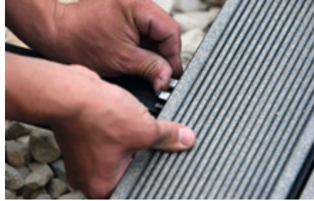
Press the bracket on