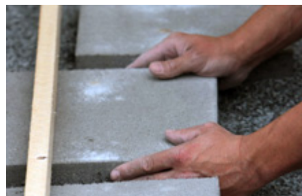
Use a surface plate to transfer the height