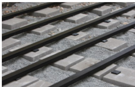
Orientation of distance and height