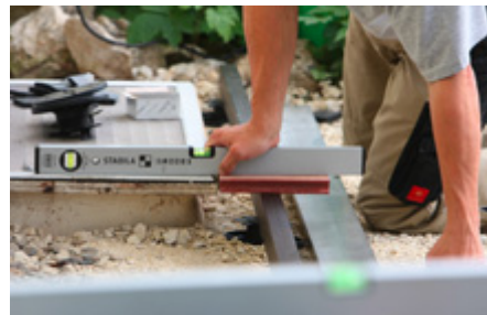
Determine a definite height