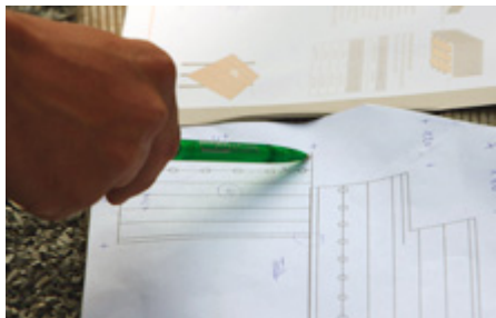
Make a plan