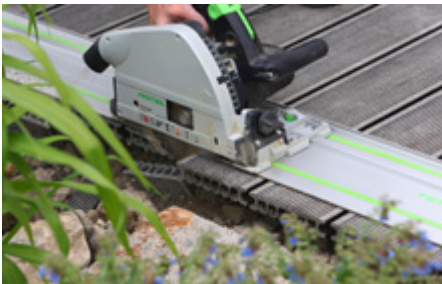
Straighten the decks