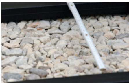
Gap to base profile