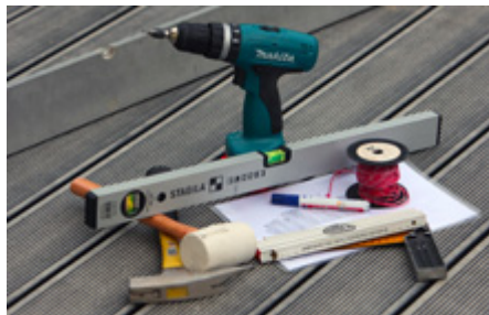
Get out your tools