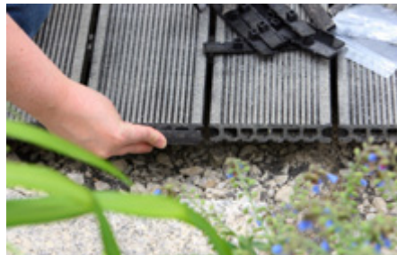
Close the profiles with the end caps