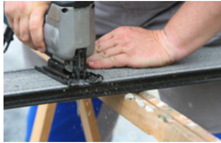
Cut the decks to size, put on end caps on one side