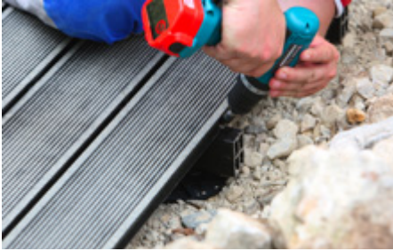
Screw the first/last deck through the profile