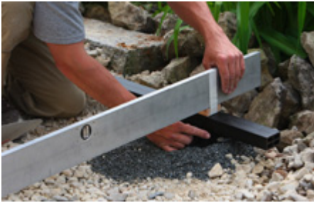
Check the slant: the wooden cube glued underneath corresponds to the difference in height