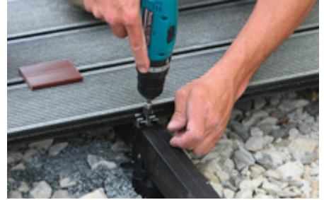
Insert the gap-aid, press the deck down and screw it on through the bracket